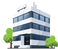
FOOD PREPARATION AREAS